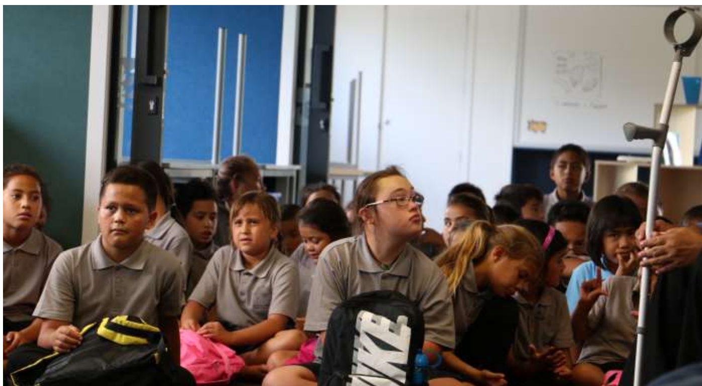
The 2016 intake of Paenuku take part in the opening of their new buildings on Tarewa Rd, Whangarei.

“Teachers are all appropriately qualified and registered. The teacher appraisal system now needs to be further developed and implemented to ensure that registered teachers are well placed to maintain their practising certificates,” the ERO report concludes.