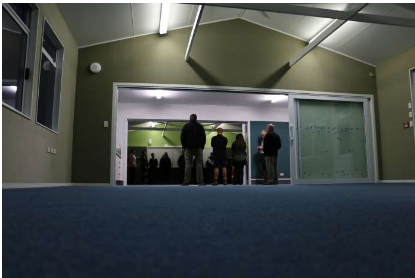
The new buildings at Paenuku were blessed in an early morning ceremony in November 2015.

The Education Review Office Assurance Review Report (February 2016) was encouraging to ngā kai mahi at Paenuku. It notes: “The Kura is committed to enabling tamariki to become competent, confident and capable learners in a bicultural setting and teachers work collaboratively, and their close knowledge of the children and their whānau provides a