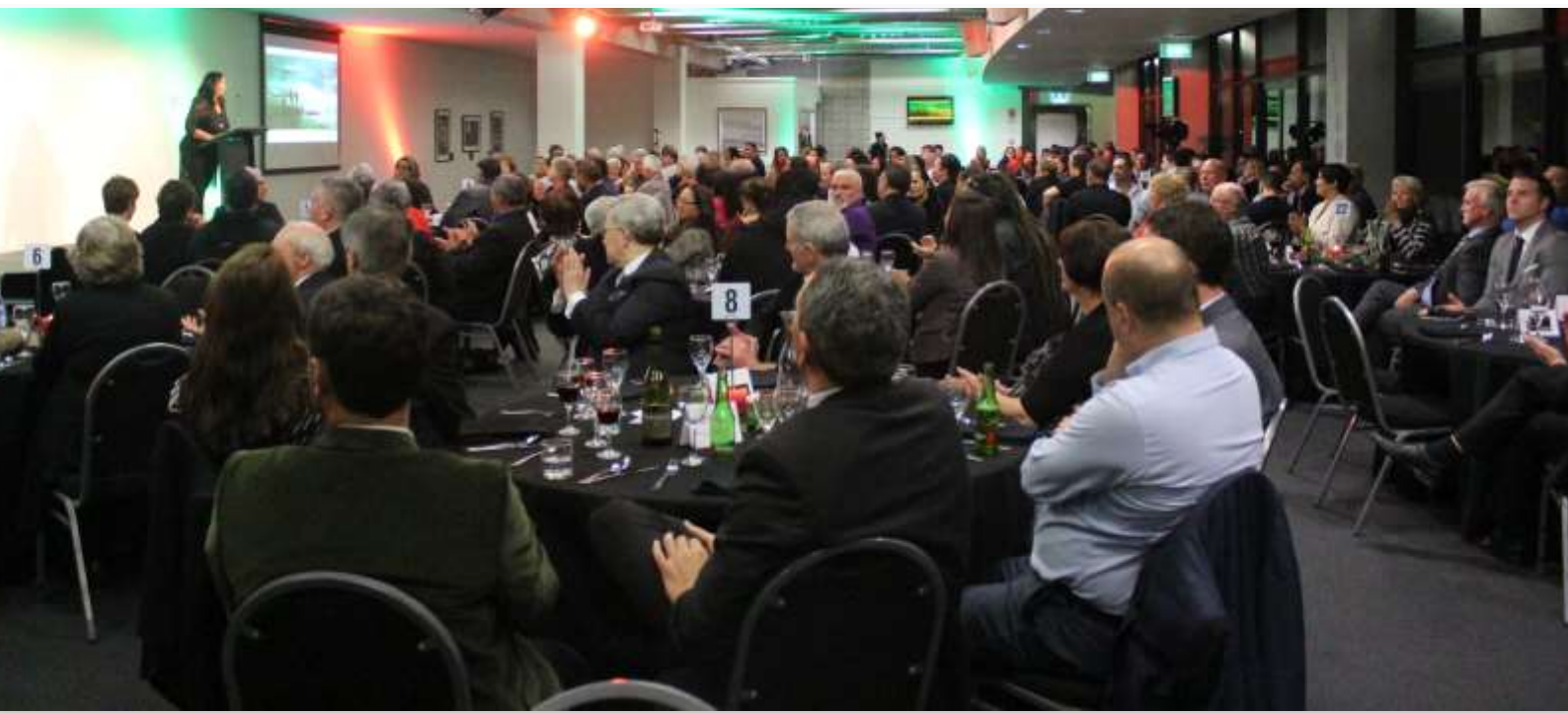
The launch of Rangatahi Inc (below) at Toll Stadium, Whangarei, late August.

The launch of Rangatahi Inc was also the product release of Inc Me—smartphone covers that replace the concept of business cards—designed and produced by senior ākonga from Te Kāpehu Whetū.