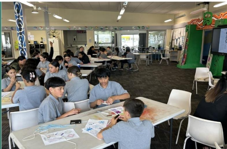
NAU MAI KI WHATU CREATIONS-HE PAKIHI MĀORI E WHAKATAIRANGA I NGĀ TOI MĀORI KI TE AO

Kia Tū Rangatira Ai: We provide an environment for the development of strong character and personal excellence so that ākonga understand how to conduct themselves honourably in the world.