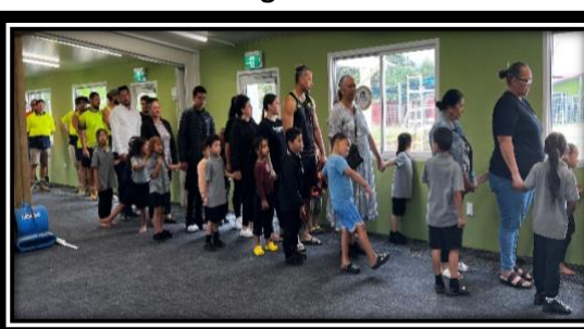
Paenuku ākonga & kaimahi