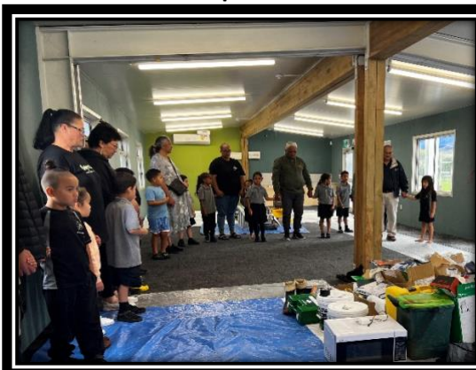
Paenuku ākonga & kai mahi