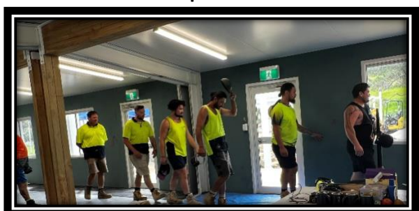
Ako kaimahi and HPMT Construction team