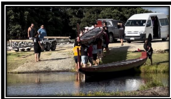
Assisting lifting Te Rangatahi onto the trailer, before heading to Waitangi 2024