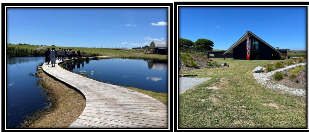
Walkway to Te Whare