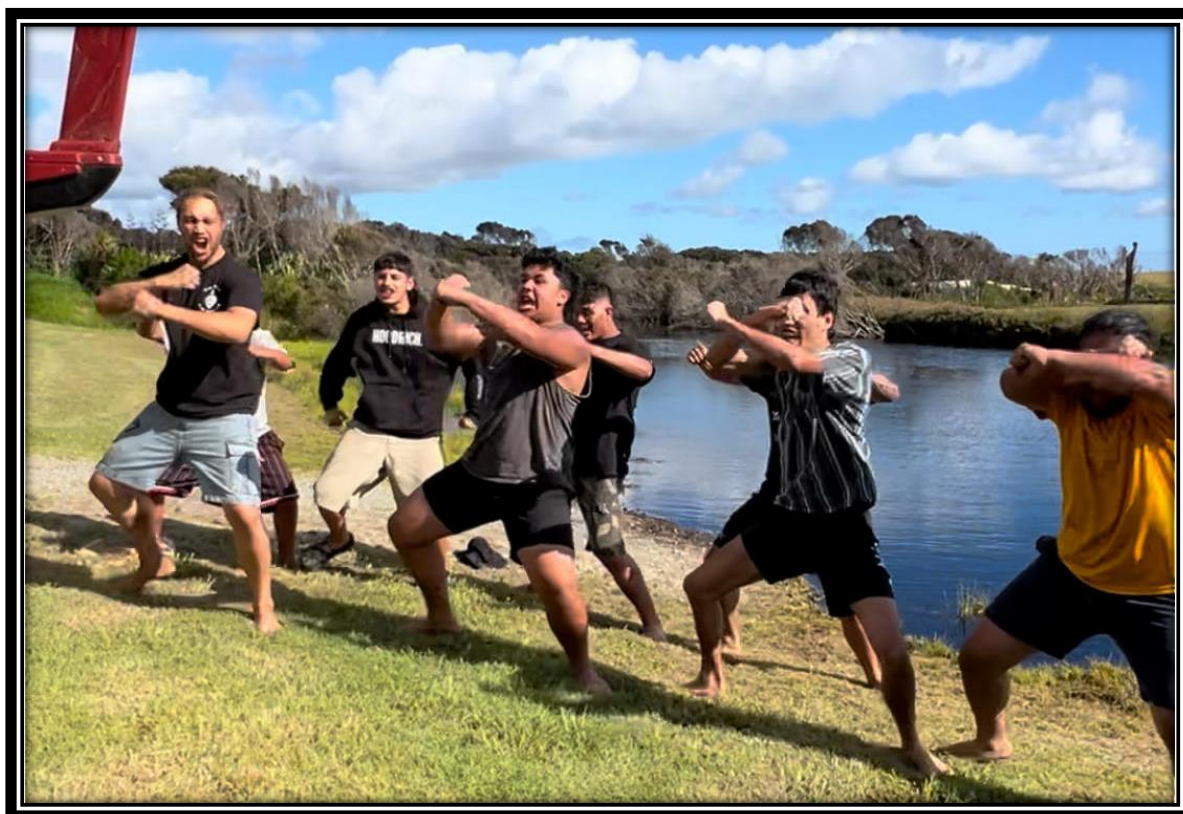
Ngā kai hoe o Te Rangatahi waka, haka to TKW