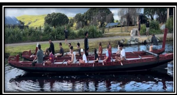
Hoe te Waka, ko Te Rangatahi