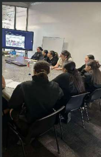
Getting instructions in tech class