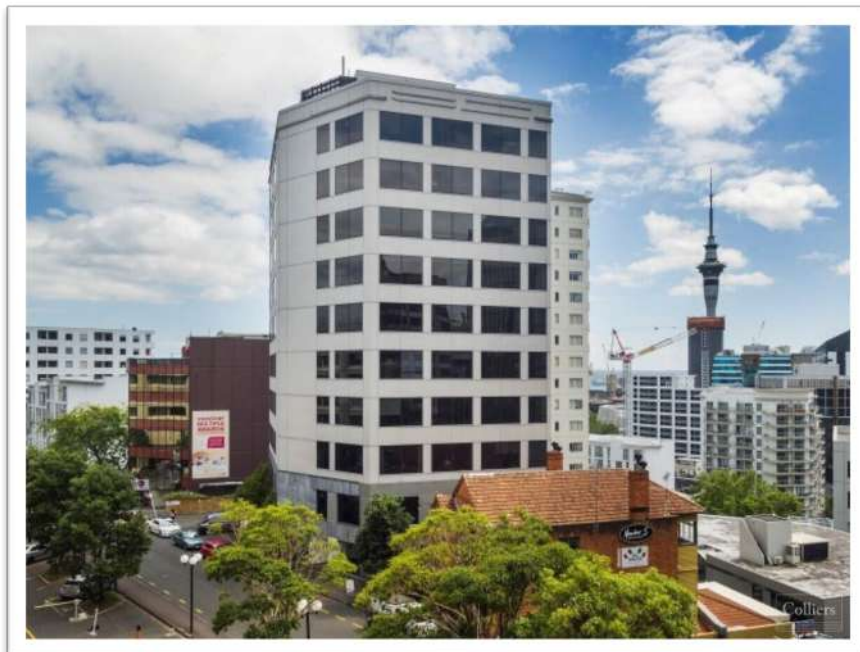
TKW Tāmaki - 7 CITY ROAD

ALSO let whanau and friends know, who might have Rangatahi in these year groups but attend other high schools, to come along if they are interested.